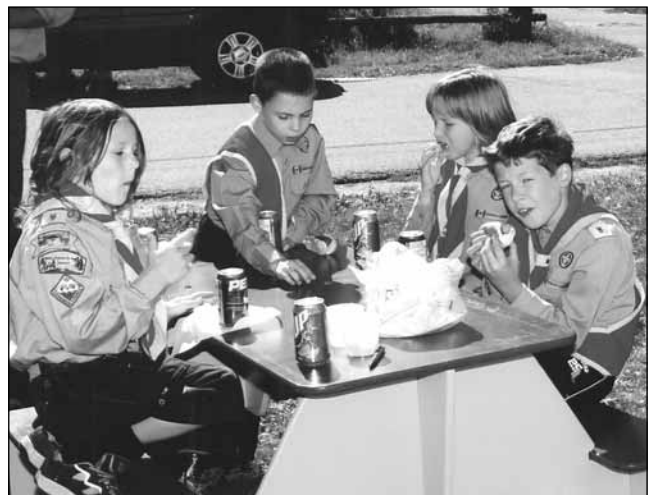
This table is perfect for our camping trips.