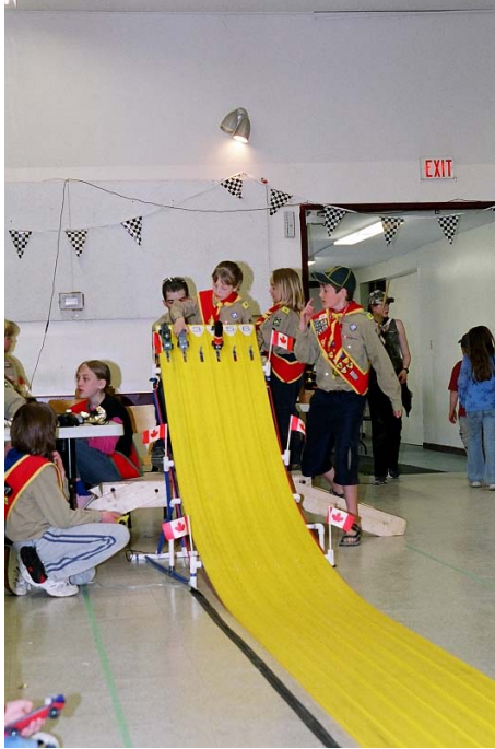
Race Track Start