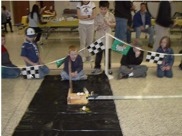
Kub Kar Seatbelt Demonstration