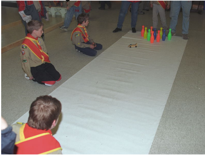
Kub Kar Bowling