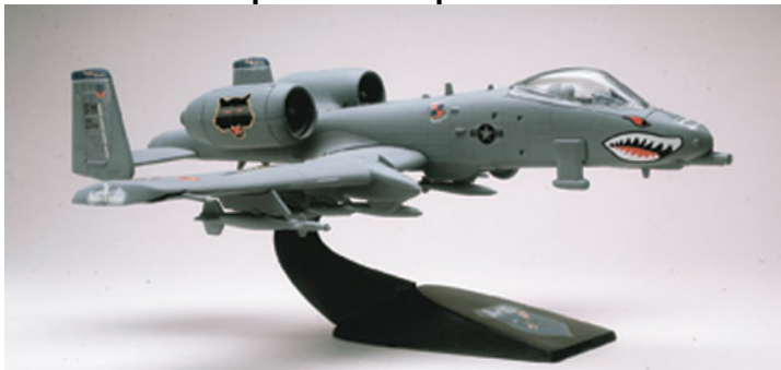
Cub Model Aeroplane - Completed Kit