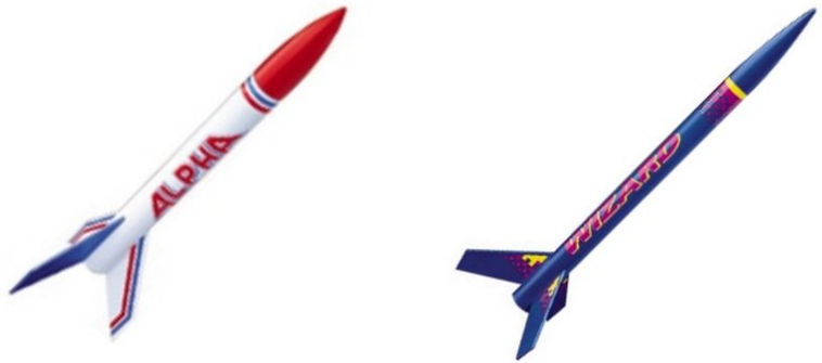
Scout Model Rockets - Completed Kits