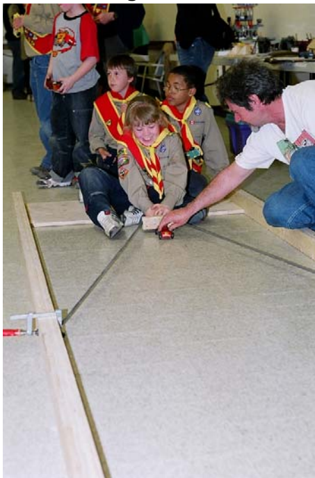
Kub Kar Slingshot