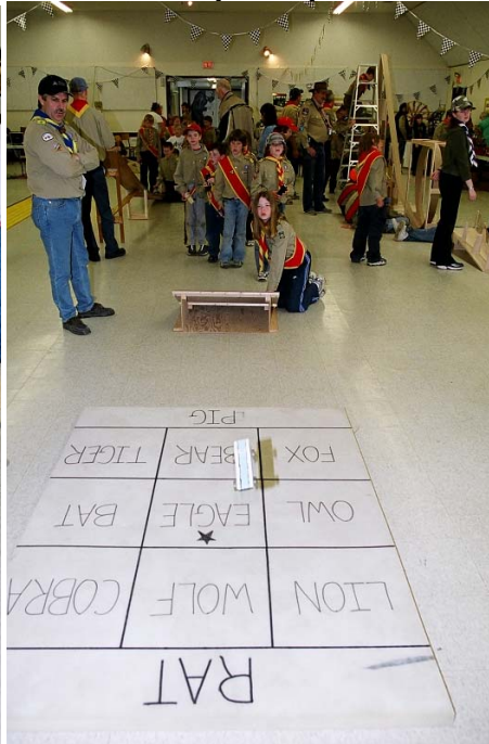
Kub Kar Ramp Jump