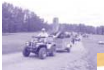
Scouts from across Alberta and western Canada attended AJ03. The smiles indicated that it was a great success.

There are numerous highlights that show this year to be very active and