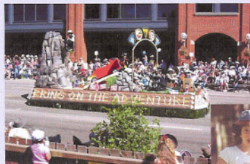
Parade Float – It's a Winner!

NLC has had another busy year. We started off with another successful Scout Popcorn Campaign in the fall. Our Leadership Breakfast in Edmonton was well attended and generated funding plus created public awareness in Edmonton and the surrounding area.