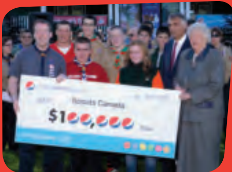
Rising to the Pepsi Challenge: Scouts Canada wins $100,000 to support its camping programs.